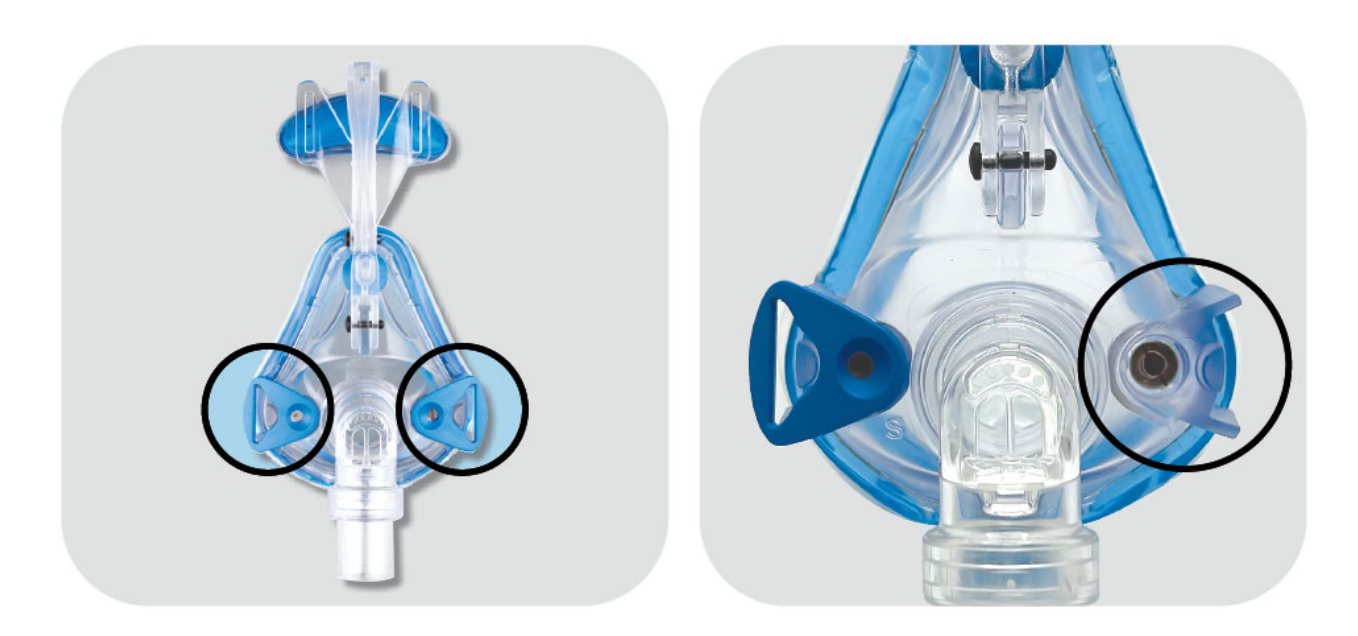
Mojo 2 Full Face Vented Mask, Mojo 2 Full Face Non Vented Mask, and Mojo 2 Full Face AAV Non Vented Mask, part numbers 50817, 50818, 50819, 50820, 50912, 50913, 50914, 50915, 50941, 50942, 50943, 50944

Mojo Full Face Vented Mask and Mojo Full Face Non Vented Mask, part numbers 50835, 50836, 50837, 50838, 50920, 50921, 50922, 50923